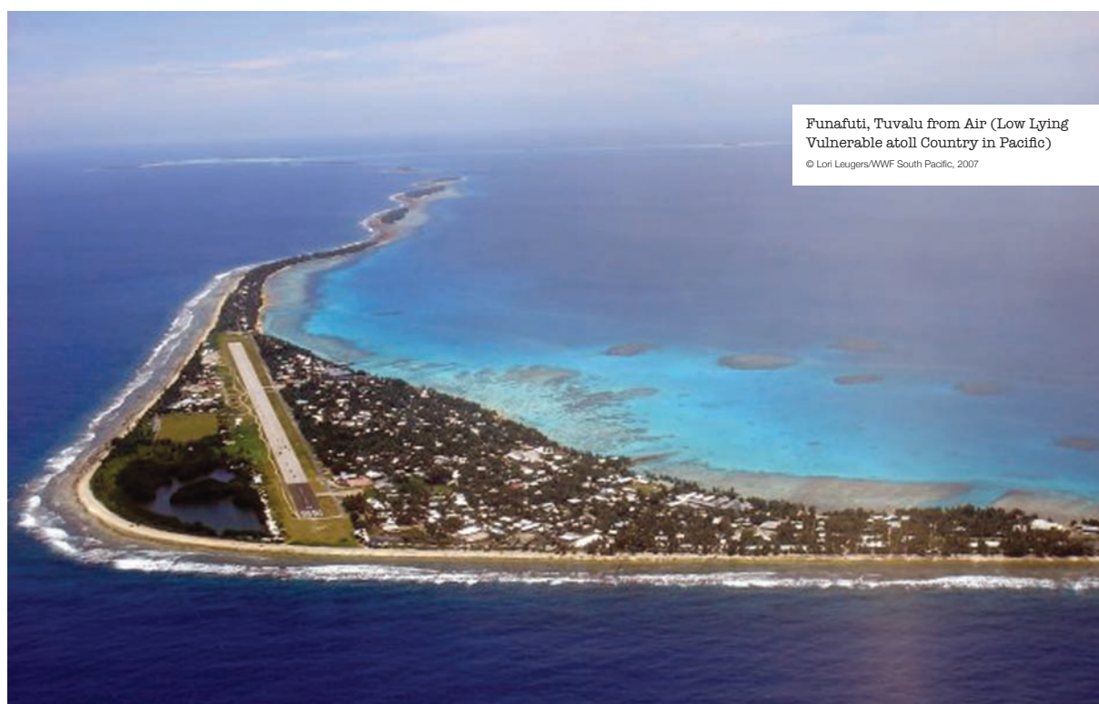
Funafuti, Tuvalu from Air (Low Lying Vulnerable atoll Country in Pacific)

The triggering of tipping elements of the climate system, thresholds where large-scale change in the earth system becomes irreversible, are much more likely in a 4°C world. These include irreversible melt of polar caps, die-back of the Amazon forests, or switch in the Asian monsoon regime. 25