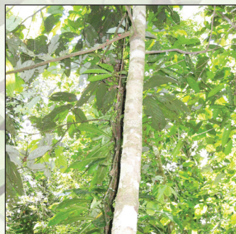
The cinchona tree from whose barks quinine is made