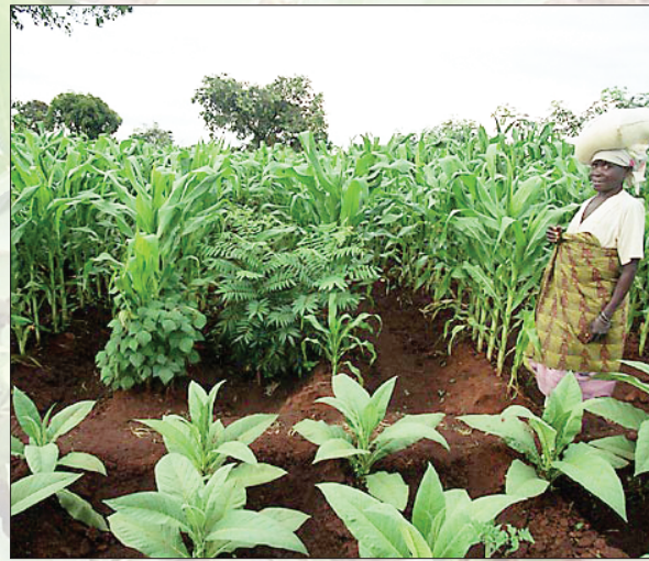
A healthy crop fertilised by the trees planted within the garden

by, a systematic approach need to be taken when introducing it. One of the most effective approaches is for farmers to accurately identify the problem (of soil degradation). Then, taking farmers on a field visit to those who have successfully practised agroforestry, with visible benefits in terms of crop yields, or showing a film of the same farmer, can stimulate interest and commitment among farmers to adopt agroforestry technologies.