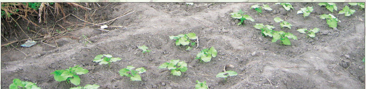
Wetlands enable cultivation in periods of extreme drought, thus increasing resilience to climate change

When wetlands are in a healthy, intact condition, they can greatly contribute to