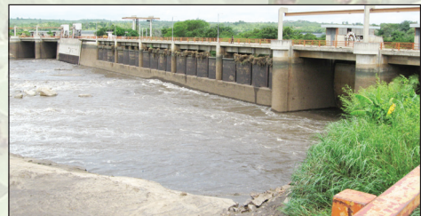
Fresh water which is fundamental to livelihoods is also a source of hydroelectricity is crucial to development