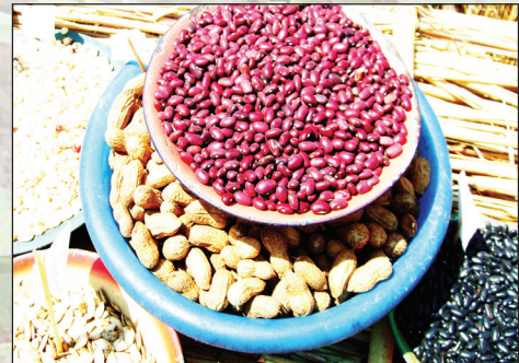
Diversity of crop types enhances food security and the ability to adapt to the growing impacts of climate change