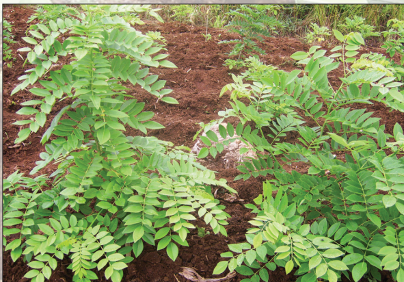
Leaves from shrubs planted in gardens is a source of organic manure

Since agroforestry benefits take long to come