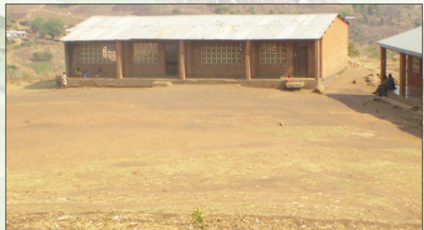
Bare grounds are typical of our school's surrounding which contributes to the degradation of land.

Ten years into the new millennium, there are many good reasons for everyone to ask questions about the environment, food and nutrition security and poverty alleviation, because growing enough food for everyone is becoming more difficult due to environmental degradation. Doubts are being expressed as to whether we will achieve the Millennium Development Goals (MDGs). Below are some of the contributing factors to this situation: