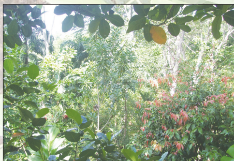
Areas rich in biodiversity hold potential for discovery of new resources to improve human welfare