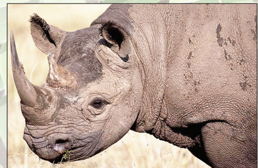
The endangered black rhino is a seed disperser in ecosystems and its horn has medicinal qualities