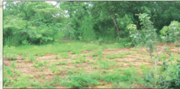
A newly reforested site; 54.6 million trees were planted in the 2009/2010 national forestry season

Due to low survival rates of planted trees, it is recommended that emphasis should also be placed on encouraging natural regeneration. Sendwe and Mangweru Hills are good examples where natural regeneration has been very successful. The practice is cheap and easy to manage. All that is needed is to protect the regenerants.