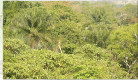
Vegetation provides for water cycling, climate regulation and carbon storage