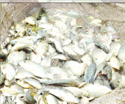
Biodiversity is a source of nutrition which is vital to sustainable livelihoods