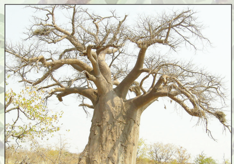
The baobab tree also called the tree of life has traditional uses for every part of it