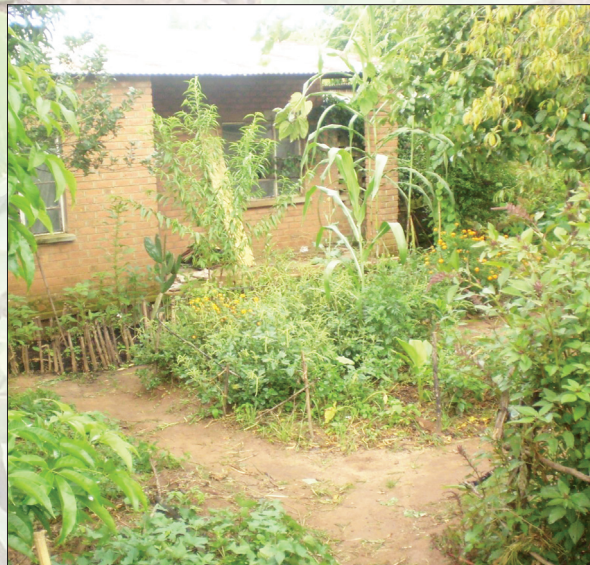
Formerly bare grounds at a teacher's house that were rehabilitated through permaculture.

The tool is called Integrated Land Use Design