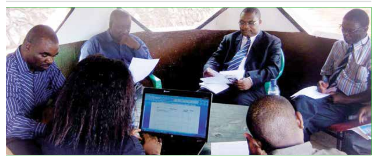
Key stakeholders discussing desired policy outcomes on agricultural biodiversity and farmers' rights at a consultative workshop held last November in Zomba.