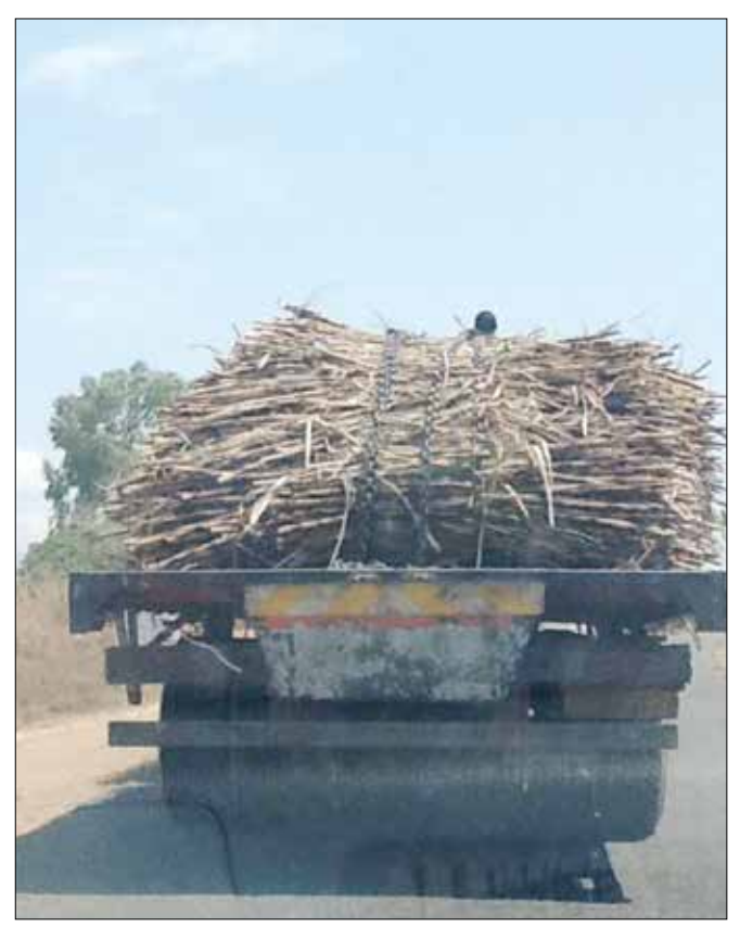
Some costs that sugarcane growers have to meet: sugarcane hauling

have not been responsive to the people's complaints.