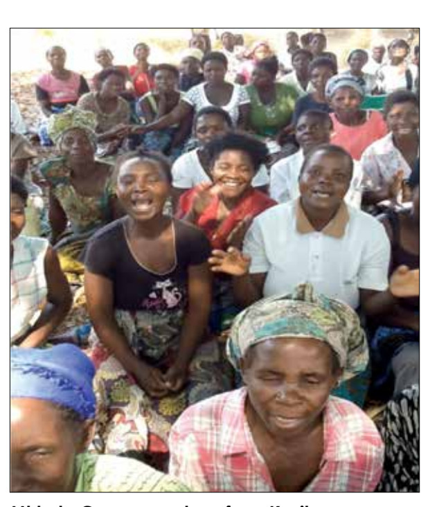
Mkhuto Group members from Kasito

This development has brought in various levels of corruption among villagers and the chiefs as people from outside the villages are coming to buy or grab land from poor people, thereby compromising their food